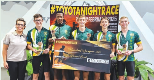
Die Hoërskool Vryburg fietspan het eerste geëindig.

Die fietsryers van Vryburg Hoërskool het 'n uitmuntende vertoning gelewer deur eerste te eindig en met 'n indrukwekkende prysgeld van R10 000 huis toe te gaan. Dit is 'n groot prestasie wat die harde werk en toewyding van hierdie jong atlete weerspieël. Laerskool Stellaland se fietsryspan het ook 'n besondere poging aangewend en tweede geëindig in hul kategorie. Hierdie jong ryers wys dat die toekoms van fietsry in Vryburg belowend is.