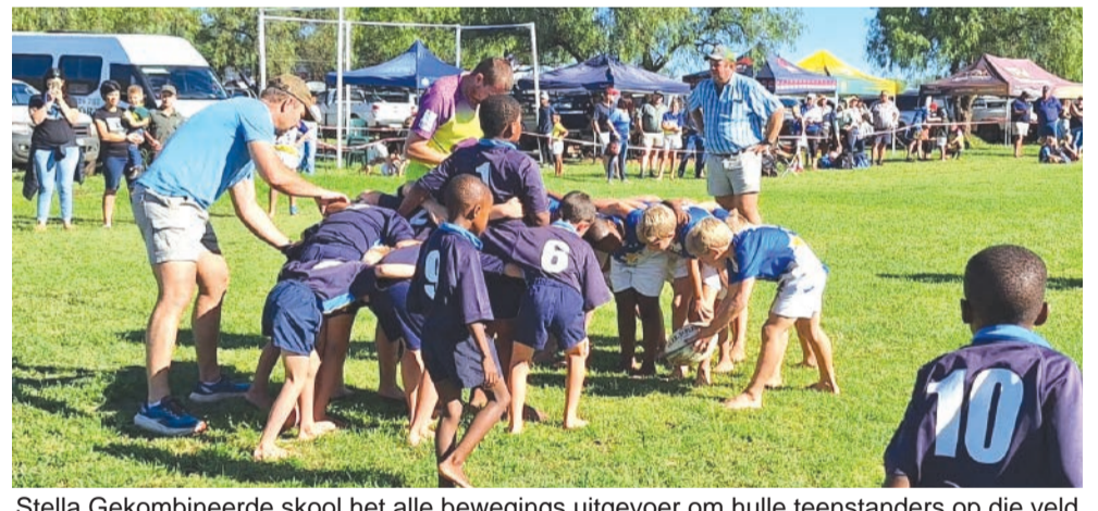
Stella Gekombineerde skool het alle bewegings uitgevoer om hulle teenstanders op die veld te klop.