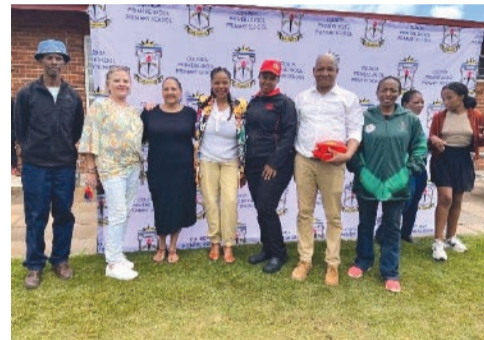
All role players involved in the Back-to-school campaign hosted at Colinda Primary School.