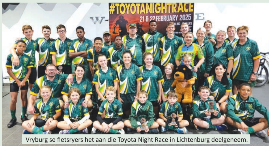
Vryburg se fietsryers het aan die Toyota Night Race in Lichtenburg deelgeneem.

The event was a resounding success, equipping learners with vital knowledge that will not only benefit their health but also enhance their academic performance and overall well-being. Kgodisho Aftercare and Reunification remains committed to supporting children through holistic programs that empower them to lead healthier, happier lives. The Back-to-School campaign continues to make a significant impact, and through partnerships with organizations and government departments, Kgodisho Aftercare and Reunification aims to extend its reach and support even more children in the future.