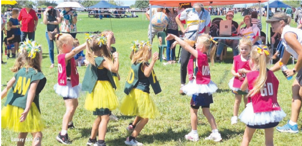
Die o/8-netbalspannetjies van Moloposkole speel hulle beste spel teen Laerskool Stellaland.

Die skool het 'n verskeidenheid eet- en drinkgoed beskikbaar gehad, wat bygedra het tot die gesellige atmosfeer van die dag. Ten spyte van die weer, was die Makiti Sportdag 'n spoggeleentheid wat sportmangees en gemeenskapstrots laat vlamvat het.