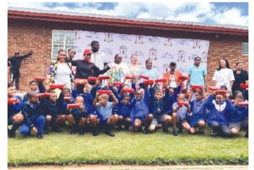
Learners from Colinda Primary School received a meal during the campaign.