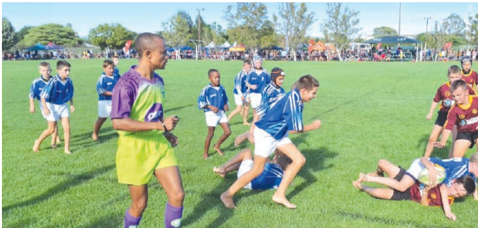
Stella Gekombineerde span maak sake op die veld moeilik vir Laerskool Seodin.