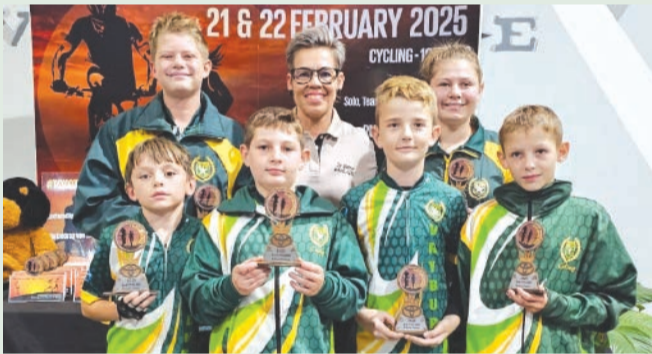
Die span van Laerskool Stellaland het nie met hulle vertoning teleurgestel nie.