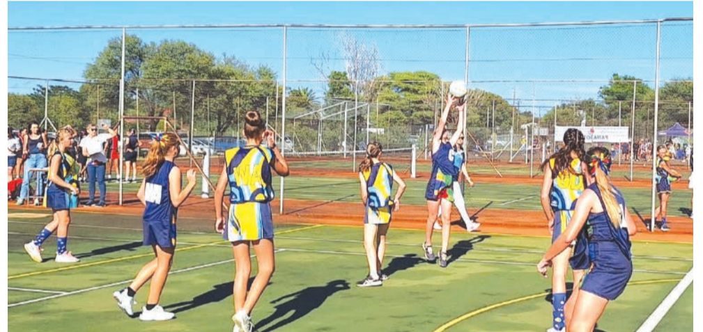
Die aktiwiteite op die netbalbane het gesorg vir groot aksie.