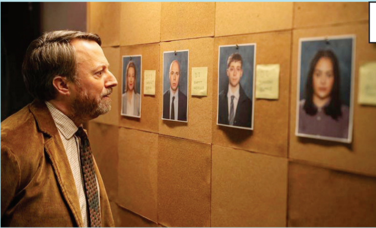
Ludwig begin op BBC Brit op DStv op 18 Maart.