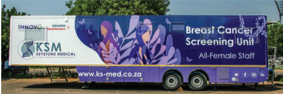
A mobile screening unit, similar to this one, will conduct mammograms and breast sonars in the early weeks of December at Glencore Western Mines, Portion 34.

Screen Save Her (a nonprofit organisation) is able to assist with financial subsidy if you WhatsApp 076 1669 883. Any other WhatsApp bookings can be made via the number 063 609 6022 or online at https://calendly.com/mammounit2/glencore