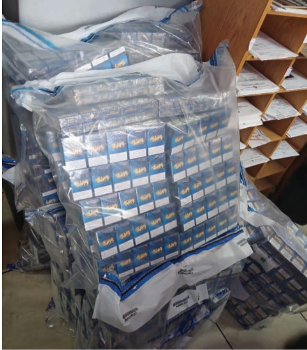
Some of the illegal cigarettes were found in the possession of two Zimbabwean nationals.

The public is urged to report Crime by calling the SAPS Crime Stop number 08600 10111 or the MySAPS application anonymously. Extortion-related incidents can be reported on the Extortion hotline on 080 091 1011.