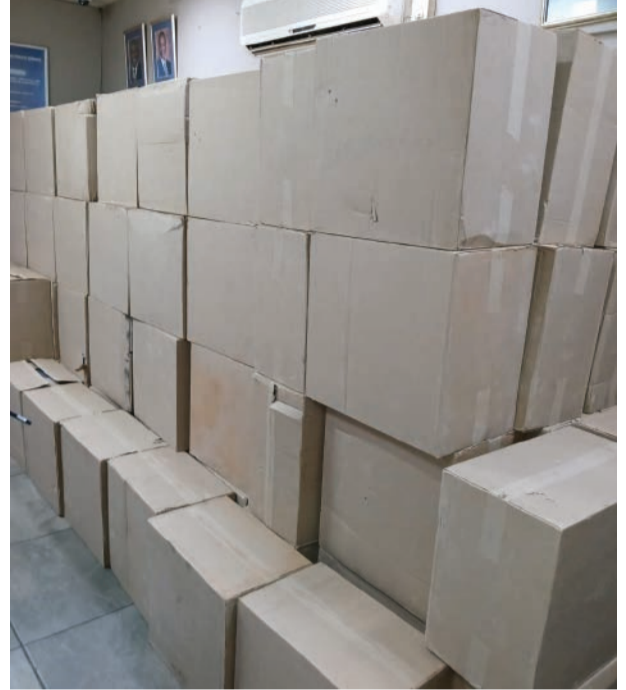
Dozens of boxes of illegal cigarettes which were confiscated by the police in a special crime intelligence operation on Friday.