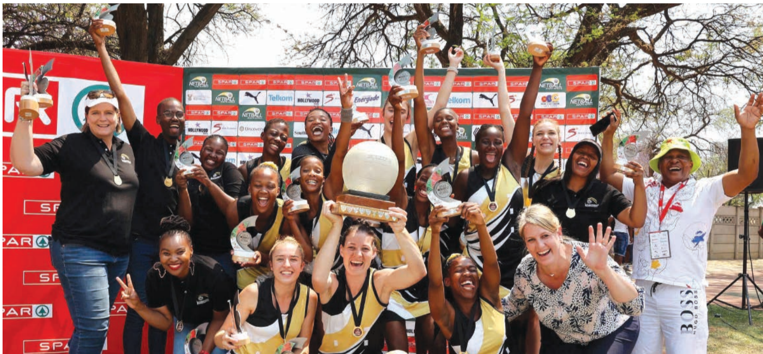
Defending SPAR National Championships winners, Johannesburg, celebrating after winning the 2023 SPAR National Netball Championships finals held at Hoërskool Rustenburg.

All persons cycling should be able to cycle at least 15km. All cyclists are required to be familiar with the road rules. No helmet, no ride. More information will follow soon.